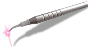
All-in-One handpiece - Code: QWHPIECE