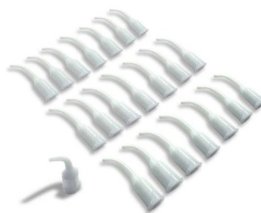
Stripable fibre disposable tips - Code: QWTIPS