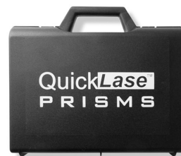
Laser Prisms Kit - Code: QWLPRISMS