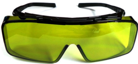
Dentist/Nurse DUAL - Code: QWPGGLASS