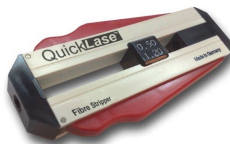
Fibre Stripper - Code: QWSTRIP