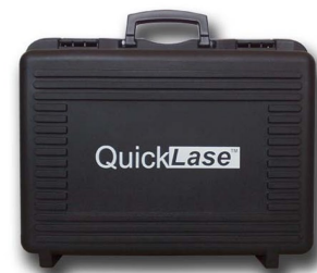
Desktop laser case - Code: QWLCASE