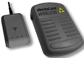
Wireless footpedal - Code: QWPEDALW