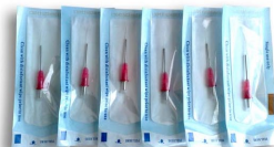
Disposable fibre tips handpiece - Code: QWDISHAND