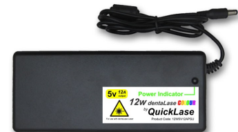
Power Supply - Code: QWPWSLY