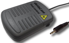
Footpedal - Code: QWPEDAL