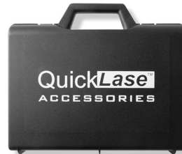
Laser Accessories Kit - Code: QWLACC