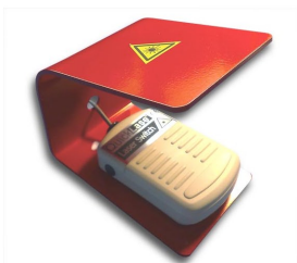
Foot switch guard - Code: QWGUARD