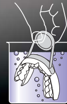
Insert the tray into the boiling water for 5 seconds