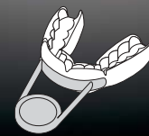
Insert the customising device